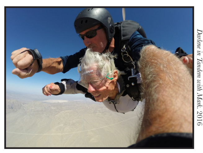
My Grandma is Love