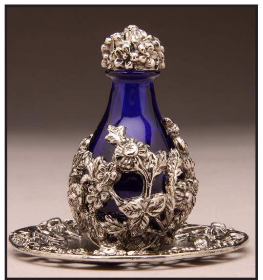
A Victorian-style Tear Bottle.

screen of the doctor's office where she lay nestled in the crook of my arm as I pointed to toes and elbows of "her baby." After many months, an appointment to my doctor's office resulted in the instruction to drive straight to the hospital, for labor had begun early. Instead, we first drove back to the house to tell our two little ones where we were going, to have one last moment as the family of four familiar to us all to navigate before receiving the tremendous gift to be five; to give them a hug and kiss before sleeping away from them for a few days; before introducing them to their baby brother whose arrival would change their world as they knew it.