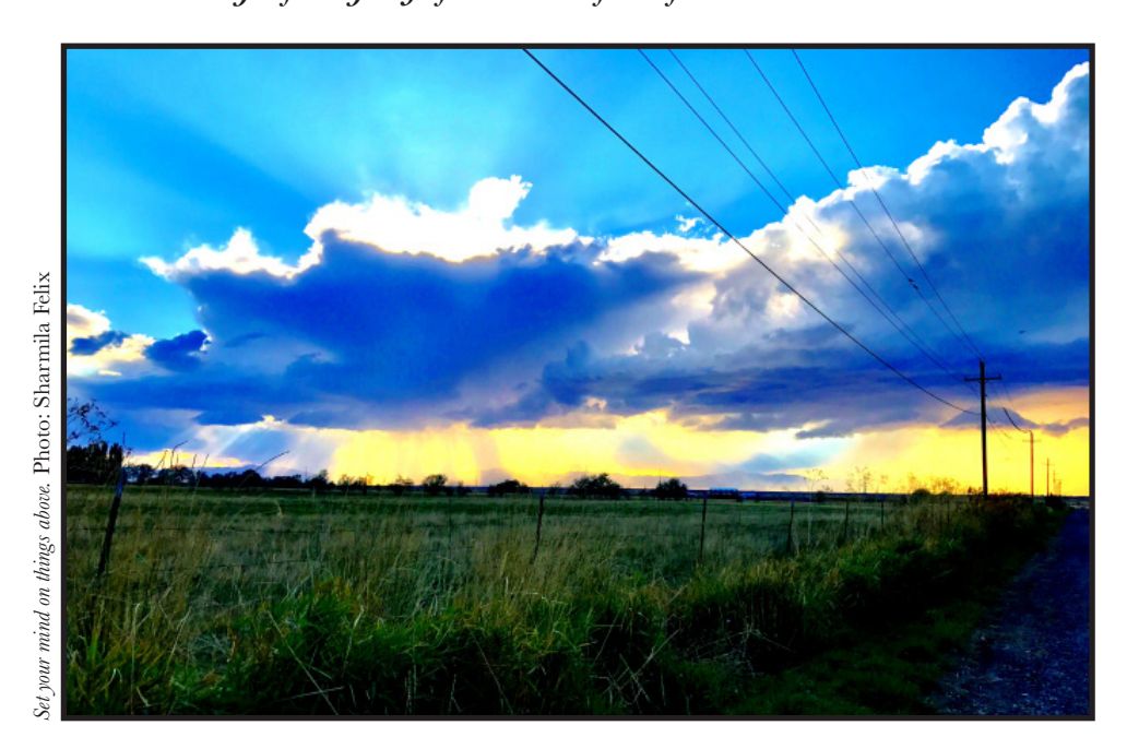
"For God, who said, Light shall shine out of darkness,' is the One who has shone in our hearts to give the Light of the knowledge of the glory of God in the face of Christ." II Corinthians 4:6