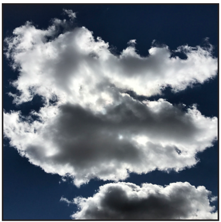
Set Your Mind on Things Above.

Thank you Jesus for all you have done and all You have yet to do! I love you. Thank you for Your love and healing power!