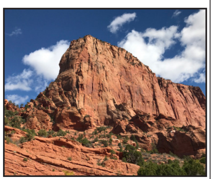
Power Belongs to God. Kolob Canyon, 2016.